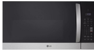
MVEM1721F 1.7 cu. ft. Over-the-Range Microwave Oven